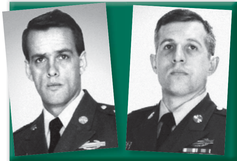
Left: Master Sergeant Gary Gordon. Right: Sergeant First Class Randall Shughart.

Flying over the crash site was another helicopter carrying two US Army Delta Force members, Sergeant First Class (SFC) Randall Shughart and Master Sergeant (MSG) Gary Gordon. Both agreed that if they did not assist the downed Blackhawk crewmembers, the crewmembers would not survive the attack. After receiving permission to help, Sergeants Shughart and Gordon took up fighting positions by the downed helicopter. Unfortunately, they found that only CW2 Durant had survived the crash. They removed him from the downed helicopter while still under attack from Somali fighters.