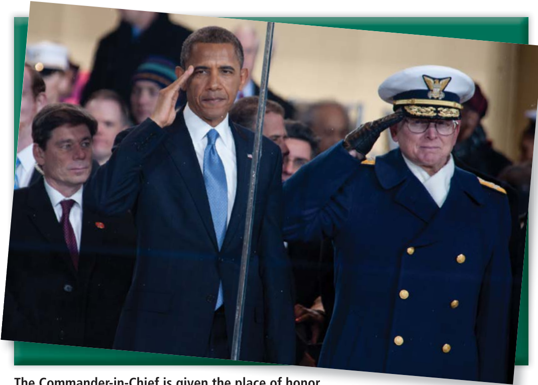
The Commander-in-Chief is given the place of honor.

Courtesy of Tech. Sgt. Eric Miller/Defense Video & Imagery Distribution System