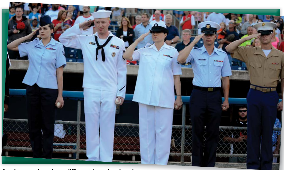
Service members from different branches in salute.

How you salute tells a lot about your attitude as a cadet. If you salute proudly and smartly, it shows your personal pride and your pride in the unit. It shows that you have confidence in your abilities as a cadet.