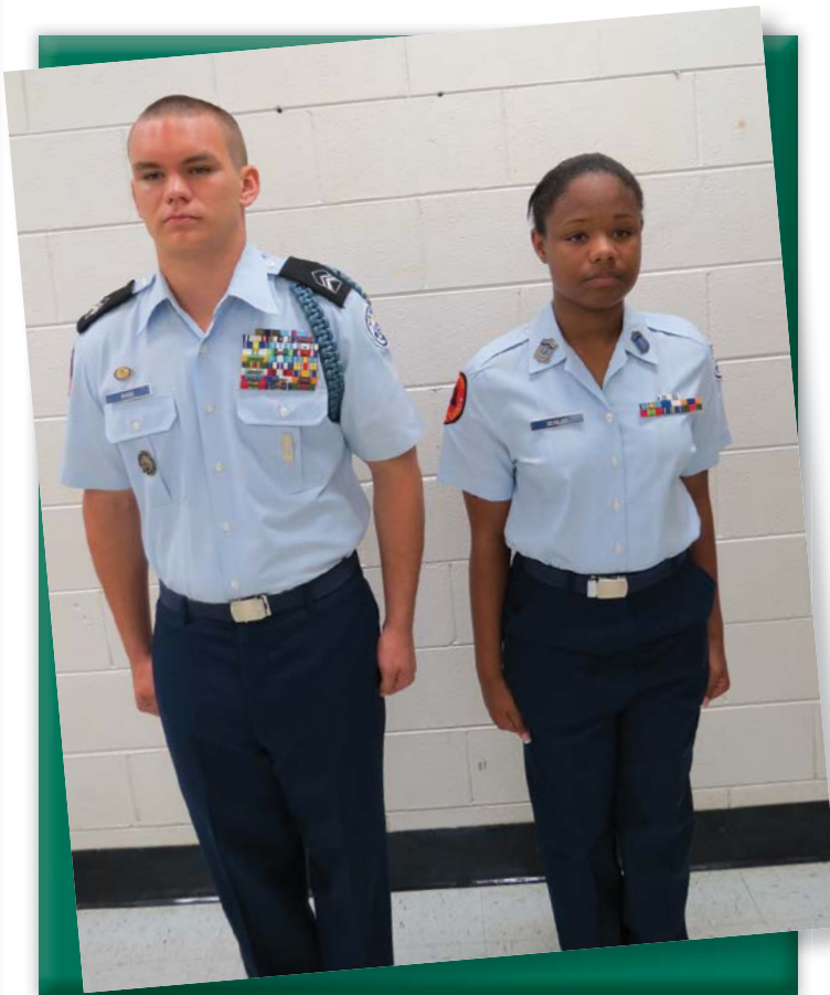
Cadets showing position of honor.

were proud of their fighting ability; they considered the right of a battle line to be a post of honor. When an officer walks on your right, he or she is symbolically filling the position of honor.